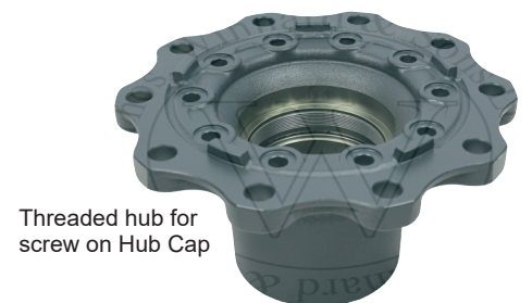
HSK0035-1 Screw in hub cap

Size options: 1. 72mm Under Head: WS0023 2. 81mm Under Head: WS0024