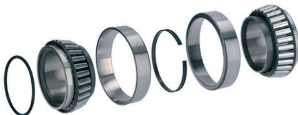
Image 2: Insert Unit

The supplied ABS ring must be used when installing the RIU. The original cassette rotary shaft seal must not be re-used.